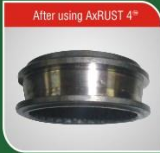
After using AxRUST 4™