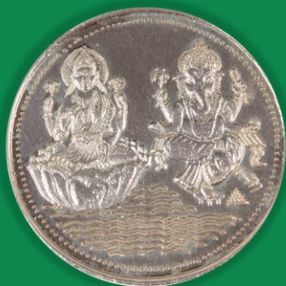
Tarnished Silver Coin