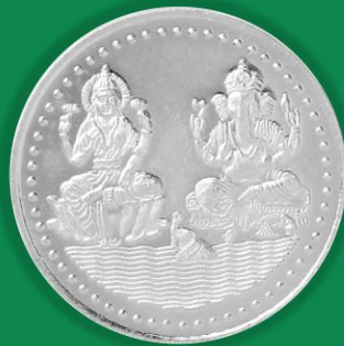
Silver Coin Protected by DURASILVER ® Anti-Tarnish film

Introducing DURASILVER ® Anti-Tarnish bags. This revolutionary product contains Zerust ® acid-gas scavengers which prevent acid gases from entering the packaging thereby protecting your silverware from oxidation and tarnish.